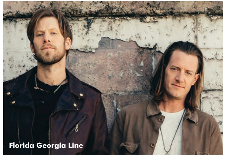
Florida Georgia Line

All of the airplay information within these pages comes from our partners at Mediabase 24/7 . Stats are based on singles that spent at least one week in the Top 50 during the 2016 chart year, which ran Nov. 17, 2015-Nov. 7, 2016.