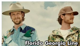
Florida Georgia Line

Finding themselves tied once again – this time with five songs each in the power gold chart – are Thomas Rhett and the top female artist on the list, Carrie Underwood . Also of note: several of the most recognizable female hits of the past 18 months are still in recurrent status, and therefore are not yet to be eligible to appear on this list.