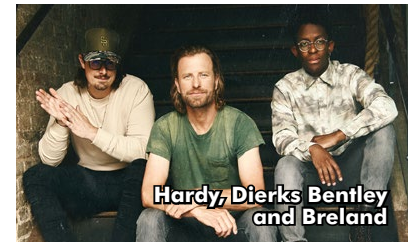
Hardy, Dierks Bentley and Breland