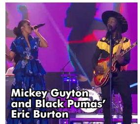
Mickey Guyton and Black Pumas' Eric Burton