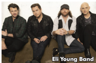
Eli Young Band

In a parking lot beside the brand new, never-been-played-in home of the Texas Rangers, more than 400 cars full of Eli Young Band fans gathered for one of what will likely be many iterations of stop-gap concert solutions. More than country music's first paid shows of the pandemic era, the Concert In Your Car weekend in the Dallas area demonstrated what could be important vehicles – pun intended – for artist development, radio promotions and a graduated return to economic solvency for organizations and individuals affected by the mid-March shutdown.