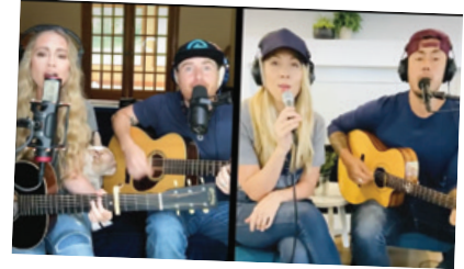
COUNTRY & GONE WESTERN

We just finished bingeing Homeland . We are so sad it's over. We loved the suspense of that show. Now, we're watching the Michael Jordan mini-series on ESPN, and it's incredibly inspiring.