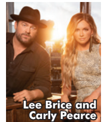
Lee Brice and Carly Pearce