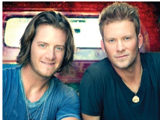
Florida Georgia Line