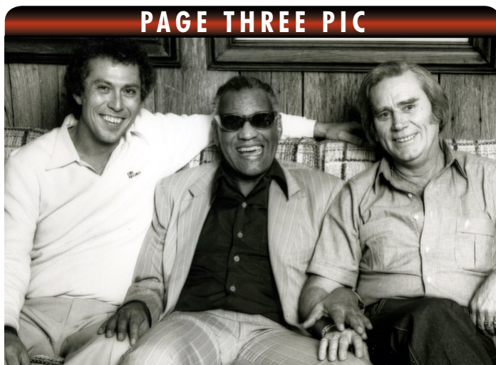
PAGE THREE PIC