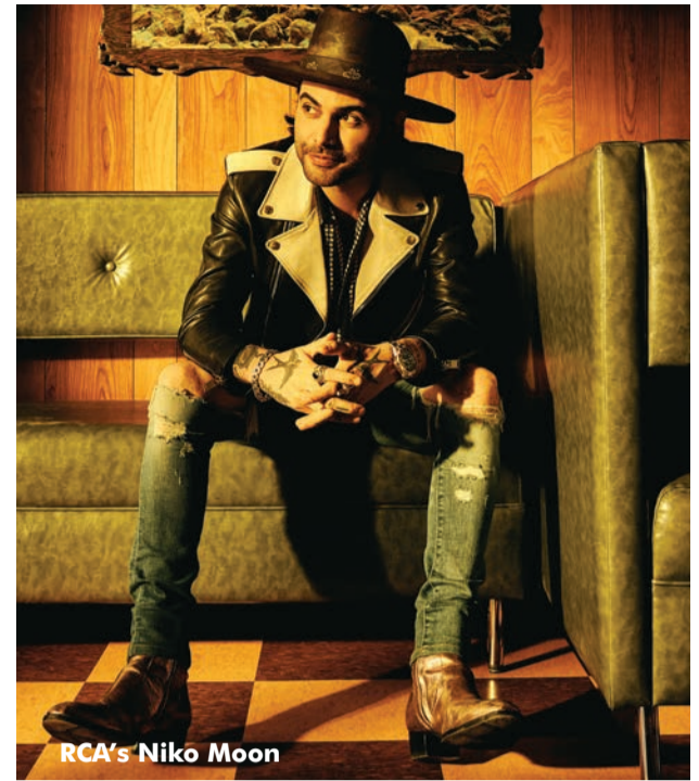
RCA's Niko Moon