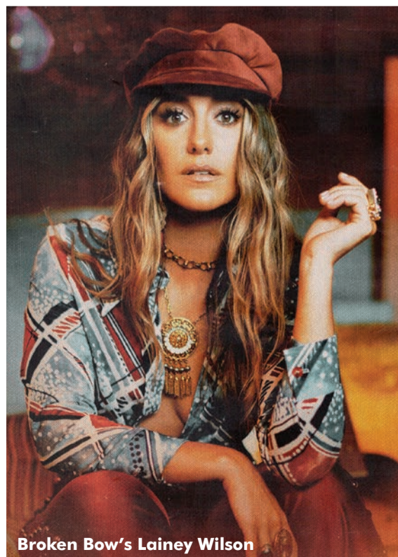
Broken Bow’s Lainey Wilson