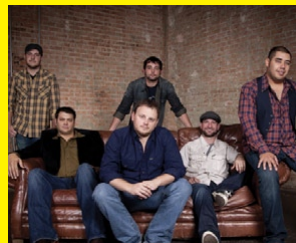
Josh Abbot Band