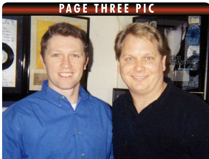
PAGE THREE PIC

©2013 Country Aircheck™ — All rights reserved. Sign up free at www.countryaircheck.com . Send news to news@countryaircheck.com