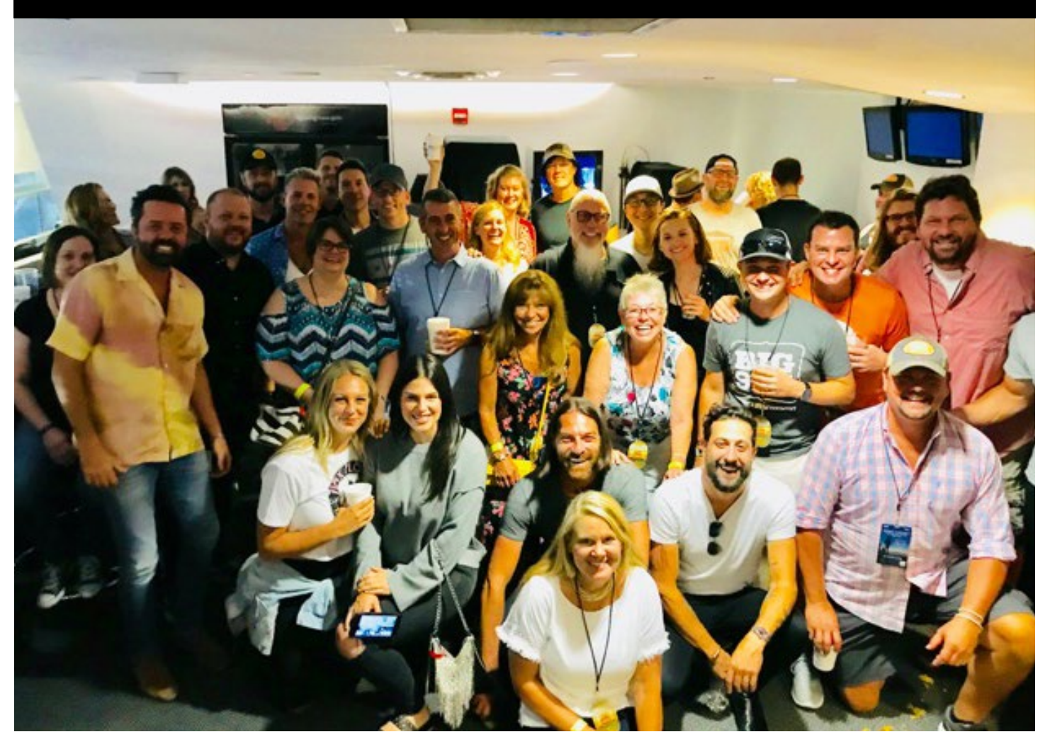
@2018 \ Country \ Aircheck^{\texttt{m}} - All \ rights \ reserved. \ Sign \ up \ free \ at \ www.countryaircheck.com. \ Send \ news \ @countryaircheck.com