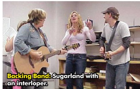
Backing Band: Sugarland with an interloper.