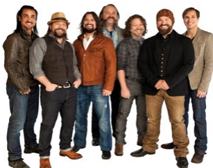
Zac Brown Band

The Zac Brown Band and Jake Owen will be a part of the four-day Bud Light Hotel pre-Super Bowl concert event on a cruise ship docked in the Hudson River in New York. ZBB will join the Foo Fighters Feb. 1, and Owen will headline the pre-game show Feb. 2, which also features Fall Out Boy. The performances will not be televised and organizers are still determining whether they'll be streamed online. See the full lineup here .