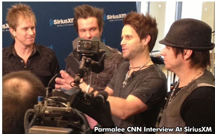
Parmalee CNN Interview At SiriusXM

But there's no time for sentimentality – it's off to the hotel for an hour or two of rack-time before our 4am lobby call and flight to LaGuardia. Lobbies, terminals, vans, green rooms and restaurants become recurring settings for bubble-in-bubble-in-